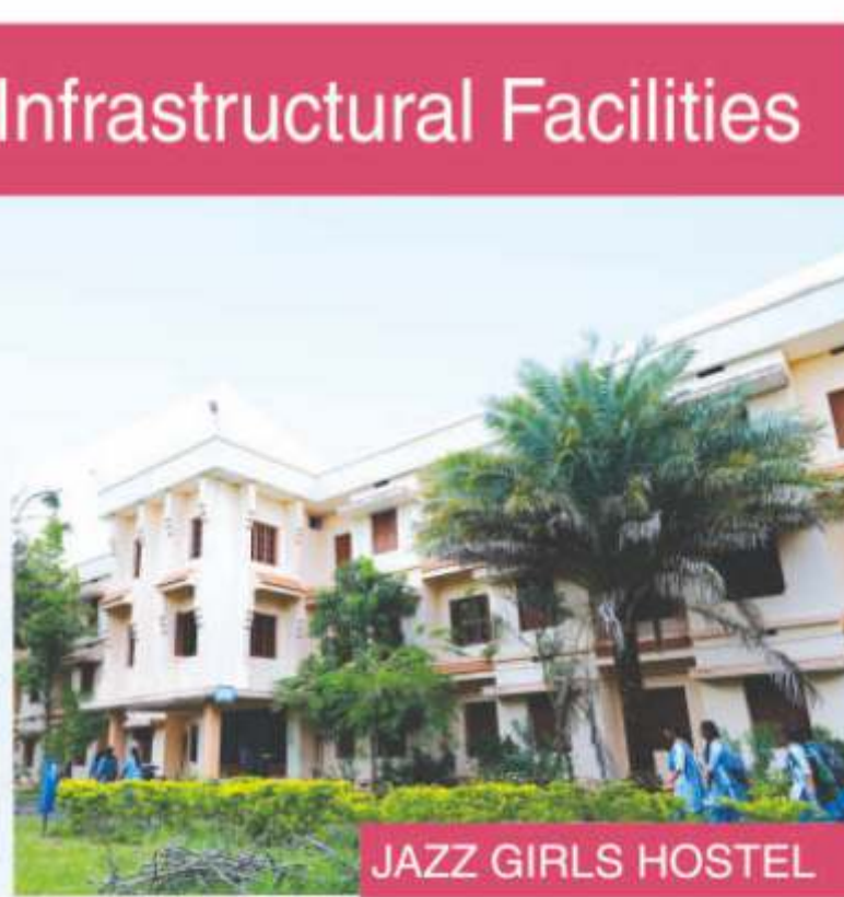
JAZZ GIRLS HOSTEL