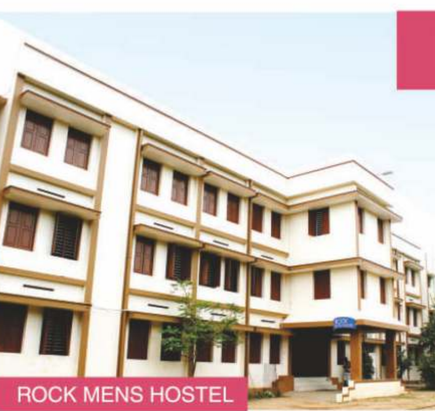
ROCK MENS HOSTEL