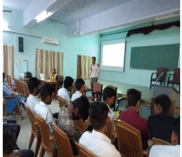
Way to Success