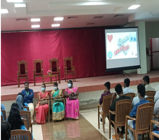
First Aid, Mental and Emotional Wellbeing