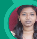
ANJANA DOLLY ATHI SOLUTIONS