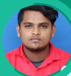
SAMEEM M DIGITAL LOGICIEL SOLUTIONS PVT. LTD.